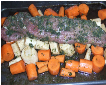
Ready for the oven